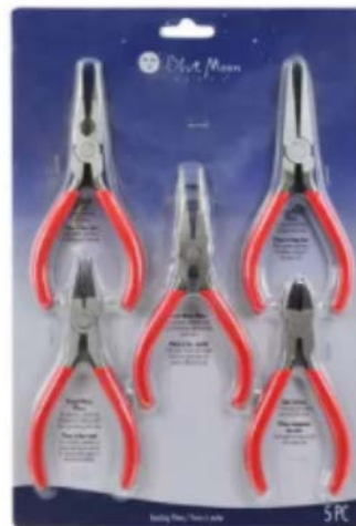
hildie & jo Jewelry 5 Piece Beading Mini Pliers Set