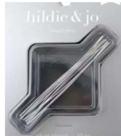
hildie & jo Silver Plated Metal Findings 2.5" Head Pin 10 Pkg