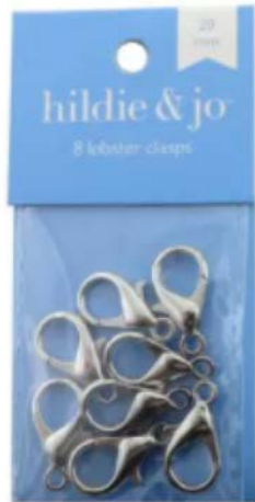
hildie & jo Findings Clasp Metal Lobster 10X21mm Silver